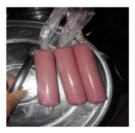
Figure 1. Lemuru fish sausage with tapioca starch and durian seed flour